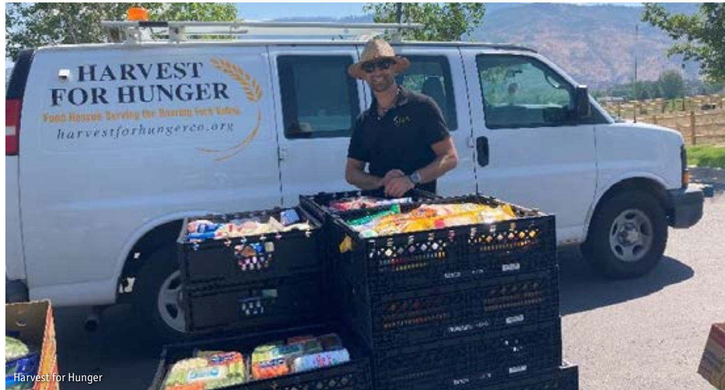
Harvest for Hunger

After more than a year, we are seeing some of the effects of the pandemic wane. Businesses have reopened and people are going back to work. The frenetic pace of housing assistance and food distribution numbers has lessened. Students persevered through the school year. Society is slowly returning to “normal”. The issues exacerbated by COVID-19 remain: housing remains a major challenge for our region, both in terms of availability and affordability. Too many in our region are food insecure. More people are experiencing mental health challenges, including youth. As we move through recovery, the remaining COVID funds will be used to continue to support economic and food assistance and will also be deployed to help address these persistent issues.