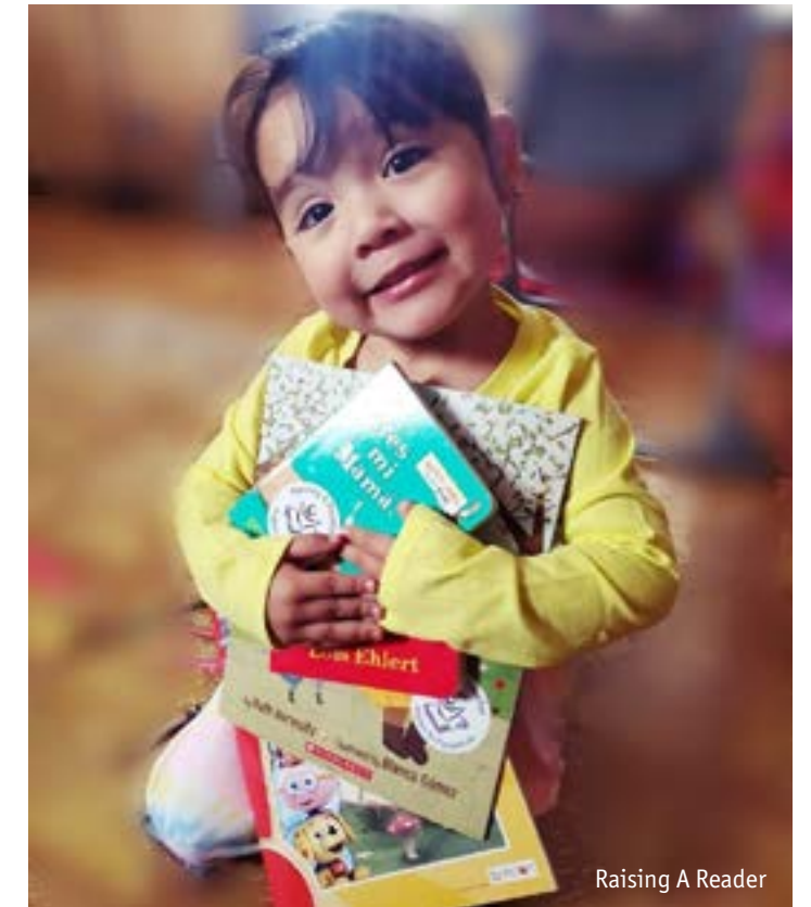
Raising A Reader

ACF's vision for Cradle to Career consists of three focus areas: