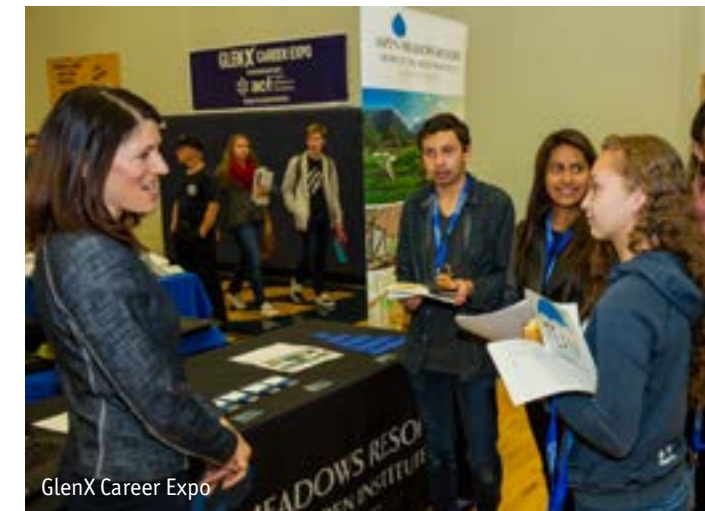
GlenX Career Expo