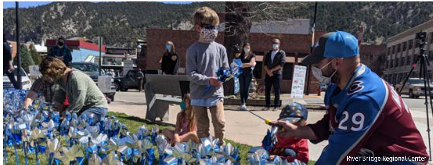
River Bridge Regional Center

Boys and Girls Club of the Peninsula The Breast Cancer Research Foundation Bridging Bionics Foundation The Buddy Program Bullitt Foundation Burning Man Project Callie's Backyard Foundation Campus Election Engagement Project Cancer Commons Carbondale Arts Carbondale Clay Center Carbondale Community School CASA for Children of Klamath County Catholic Charities, Western Slope Cedar Mesa Animal Clinic Celebrate the Beat National Dance Institute Center for Prevention and Treatment of Disease Through Nutrition Center for Reproductive Rights Chabad Jewish Community Center Challenge Aspen Chapman University Cheetah Conservation Fund Cheshire Project Chiara Home Children's Hospital Colorado Foundation Chris Klug Foundation City Net City of Aspen Clean Energy Economy for the Region The Climate Reality Project Codepink Women for Peace Colorado Animal Rescue Colorado Cattlemen's Agricultural Land Trust