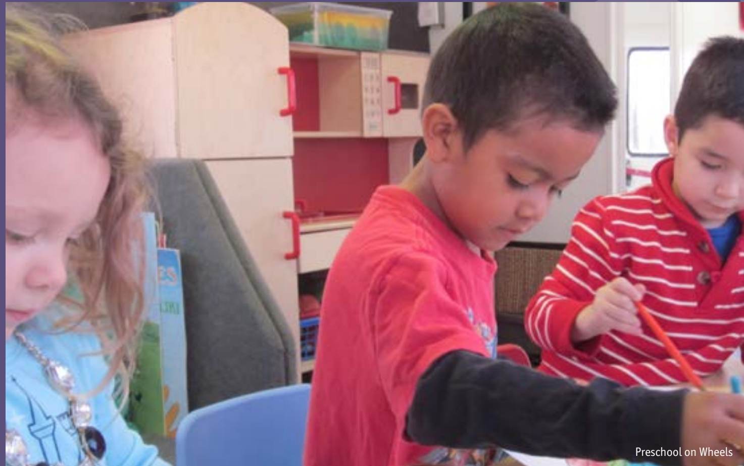
Preschool on Wheels

Since 2012, Cradle to Career has provided a platform for our community partners in the Aspen to Parachute region to work together to advance youth outcomes. Many of the region's 20,000 young people face significant barriers to health and long-term success—barriers that surface in achievement gaps between Anglo and Latinx youth. ACF and its partners are committed to advancing equity in our work.