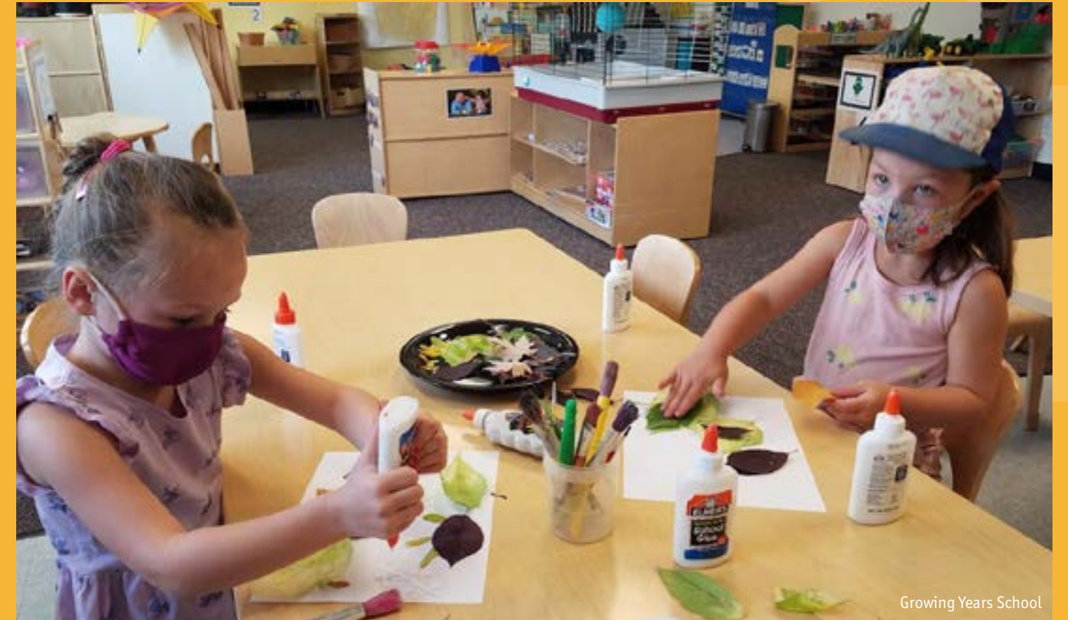
Growing Years School

Aspen Community Foundation prioritizes efforts that address critical needs and increase access for the under served throughout the region, expanding opportunities for all to live healthy, enriched, independent lives. Through the generosity of contributors, ACF supports nonprofit organizations that serve children and families and provide essential human services, as well as those caring for the environment and our natural resources. Our impact extends to helping individuals access mental health services and assisting those who experience temporary financial hardship.