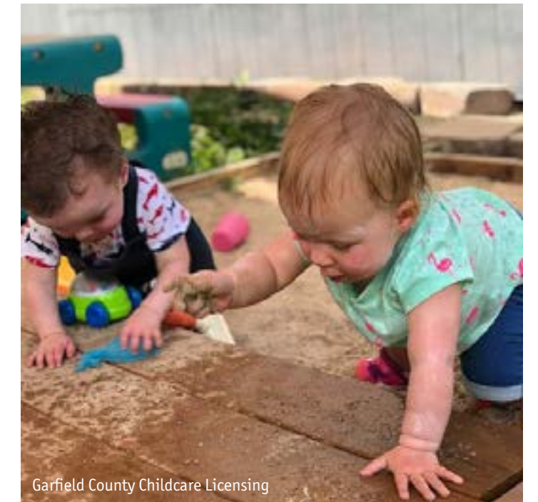
Garfield County Childcare Licensing

Aspen Junior Hockey Endowment Fund Aspen Santa Fe Ballet Endowment Fund Bob Beattie Endowment Fund of Aspen Valley Ski/Snowboard Club The Buddy Program Endowment Fund Angus L. Graham Memorial Fund Grassroots Asia Organization Fund Holly and Richard Glasier Colorado Animal Rescue (CARE) Fund Holly and Richard Glasier Colorado Mountain College Designated Fund Holly and Richard Glasier Valley View Hospital Designated Fund Rip McManus Endowment Fund Roaring Fork Leadership Endowment Fund Thunder River Theatre Company Endowment Fund Thunder River Theatre Company General Fund Valley View Hospital Foundation Endowment Fund YouthZone Foundation Fund