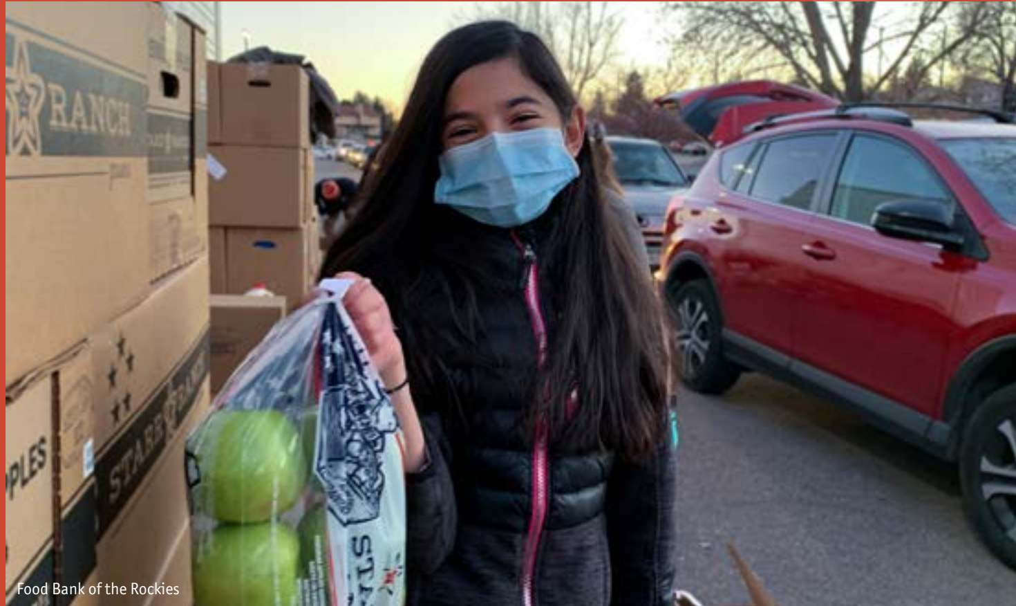
Food Bank of the Rockies

ACF established a disaster philanthropy in 2005 to provide a vehicle for donors to support local, national, and international disasters. ACF's disaster philanthropy efforts in response to either environmental, economic, or social crises not only address the immediate relief and short-term recovery of disaster victims and impacted communities, but also pays attention to long-term needs such as planning, preparedness, and mitigation.