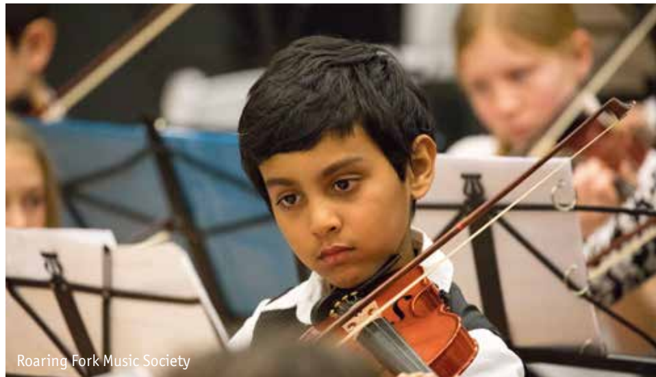
Roaring Fork Music Society