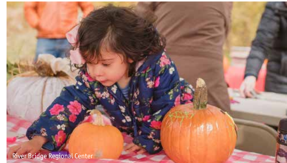
River Bridge Regional Center

Garfield School District Re-2 GlenX Career Expo Grand Canyon University Growing Years School LIFT-UP Literacy Outreach MANAUS Mental Health Fund (68 clients) Mount Sopris Montessori School OUR School Planned Parenthood of the Rocky Mountains, Glenwood Springs QF Community Leadership Foundation Quality of Life Project - Aspen Valley Hospital (51 clients) Raising A Reader Aspen to Parachute Response River Bridge Regional Center Roaring Fork Music Society Roaring Fork PreCollegiate Roaring Fork School District Re-1 Serve Colorado Stepping Stones Summit54 Theatre Aspen Valley Settlement Western Slope Rural Philanthropy Days Yampah Mountain High School Yampah Mountain High School & Teen Parent Program Youthentity YouthZone