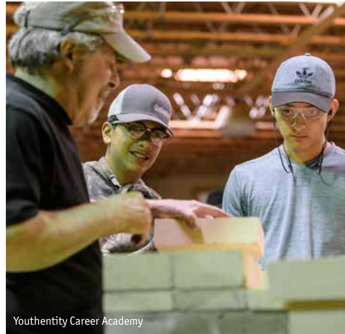
Youthentity Career Academy

Helping students explore career pathways and develop a plan for postsecondary education are key to ensuring students are on a course that leads to economic independence. Prior to the launch of the Cradle to Career Initiative, access to programs to support students in postsecondary preparation and planning was limited. Thus, many students didn't have the guidance and support to explore college and career options so that when they left high school, they weren't equipped. Counselors in each of the schools work with students through one-on-one advising, connecting students with internship and job shadowing opportunities, and informing them of available scholarships to help them pursue a certificate or degree.