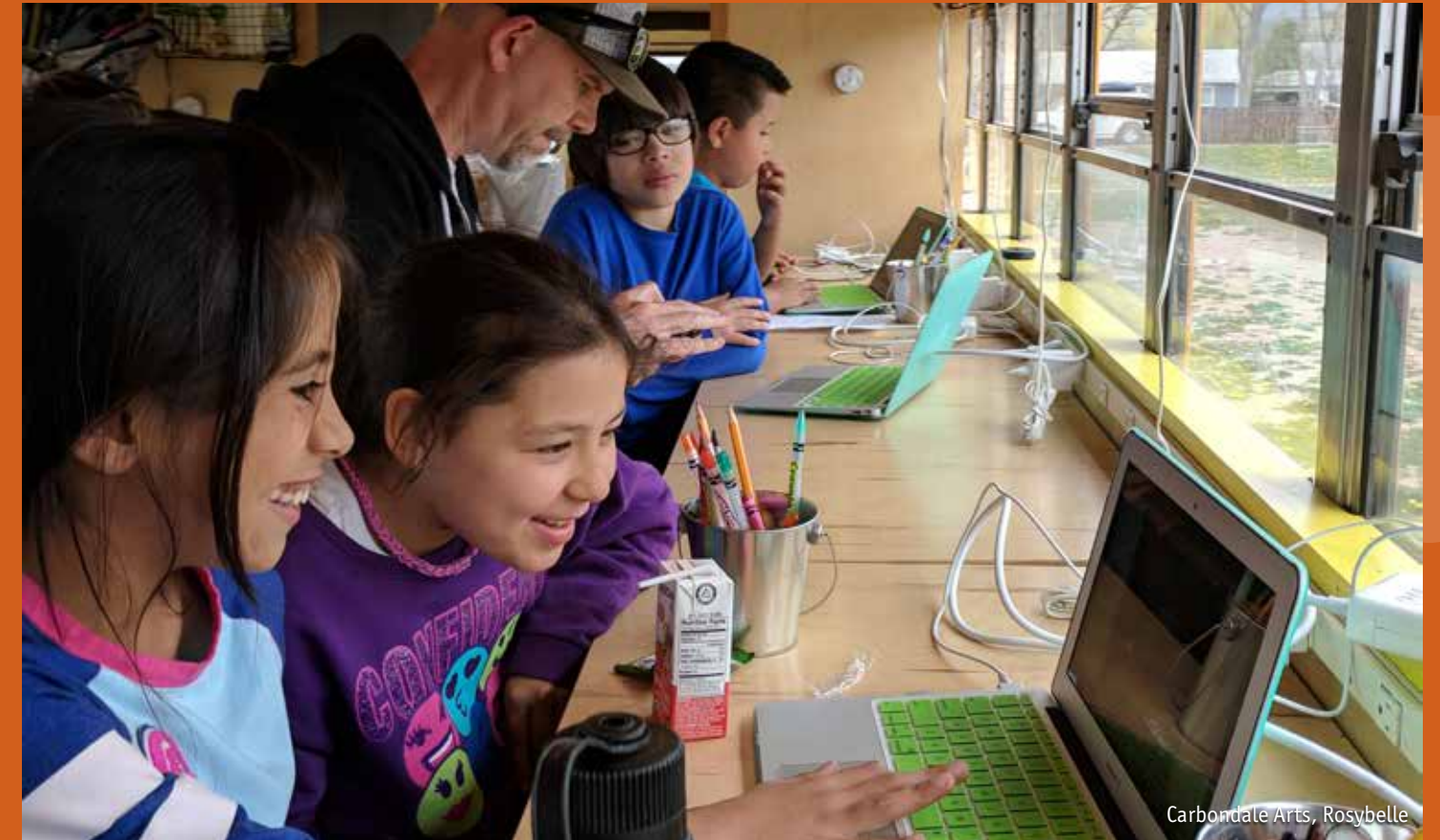
Carbondale Arts, Rosybelles

ASPEN COMMUNITY FOUNDATION PRIORITIZES EFFORTS THAT ADDRESS CRITICAL NEEDS and increase access for the underserved throughout the region, expanding opportunities for all to live healthy, enriched, independent lives. Through the generosity of contributors, ACF supports nonprofit organizations that serve children and families and provide essential human services, as well as those caring for the environment and our natural resources. Our impact extends to helping individuals access mental health services and assisting those who experience temporary financial hardship.