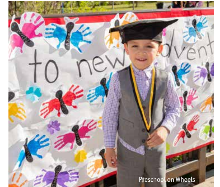
Preschool on Wheels

The Ready for Kindergarten Network has seen success in the expansion of quality, licensed, early childhood education throughout the region. Since young children's brains develop in all caregiving environments and most children are only in licensed programs part of each week, supporting parents and caregivers in providing the most enriching and responsive experiences before kindergarten became the next priority of the work.