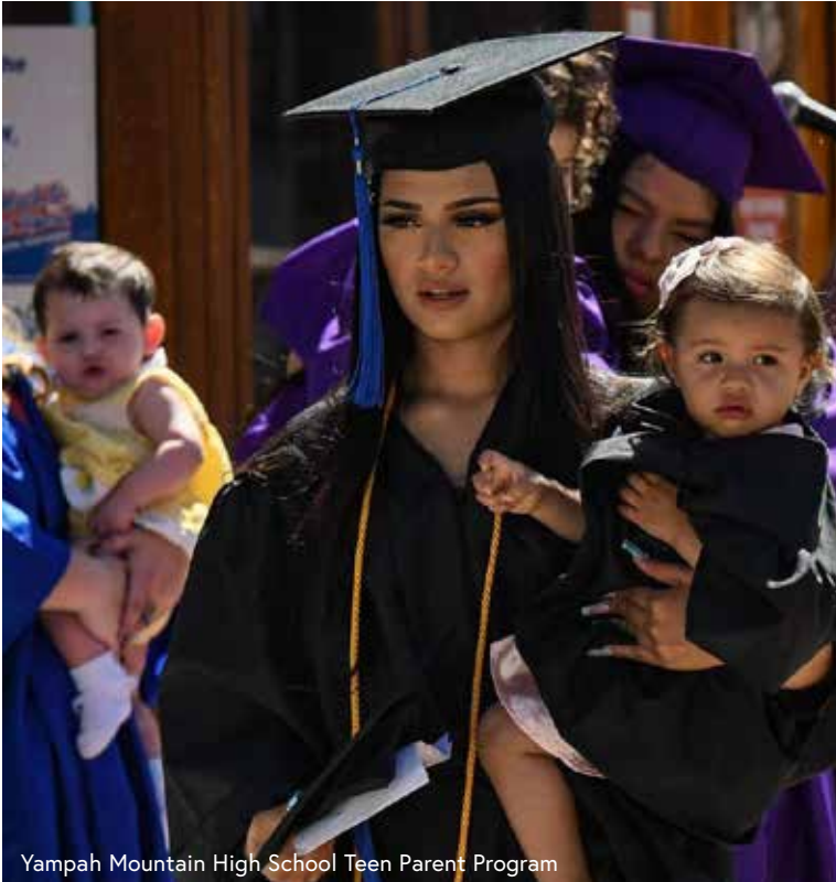
Yampah Mountain High School Teen Parent Program