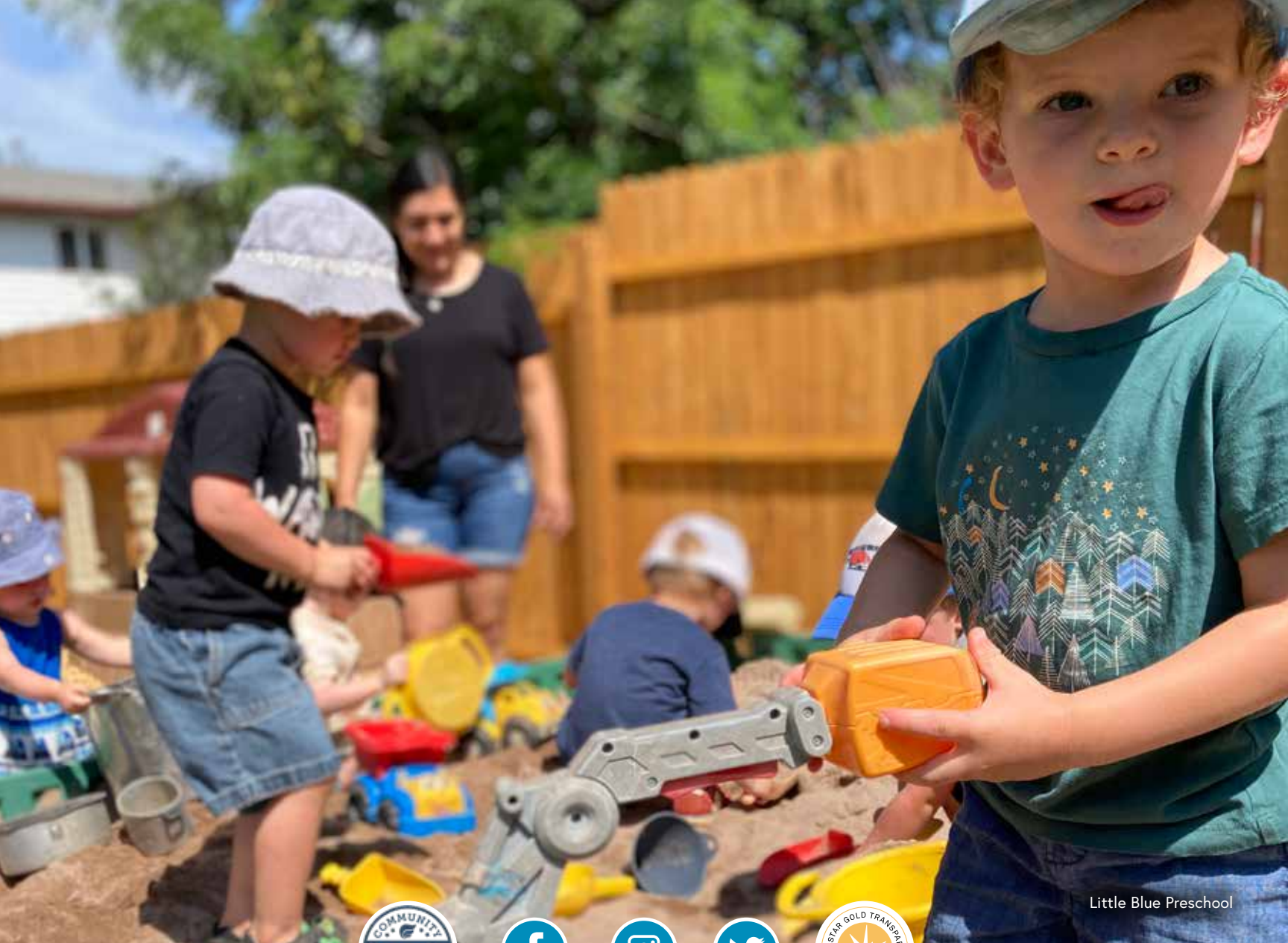
Little Blue Preschool