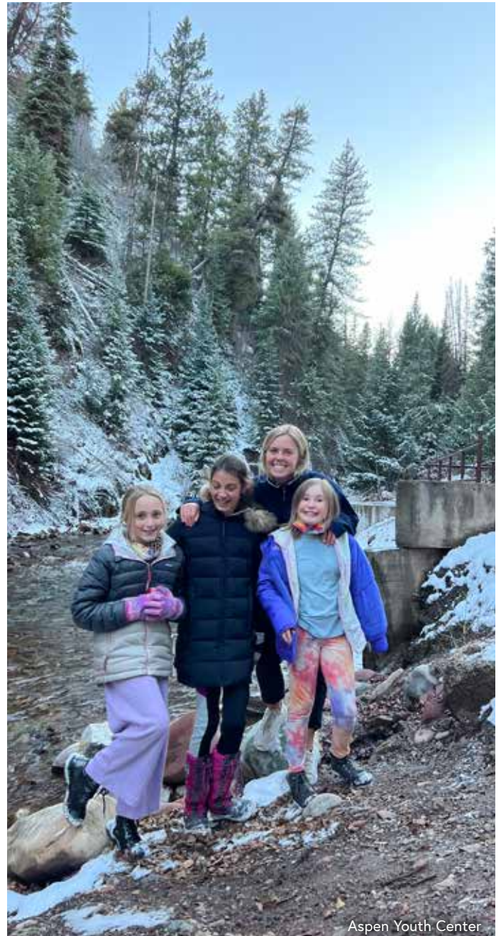
Aspen Youth Center