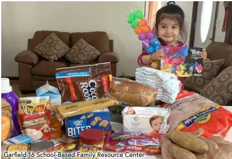
Garfield 16 School-Based Family Resource Center

As we approach the two-year mark of when COVID-19 emerged in the Aspen to Parachute region, the frenetic pace of disaster response has lessened but not gone away. ACF remains invested in ensuring that individuals and families, particularly those who remain disproportionately impacted by the pandemic, can access the support they need to thrive.