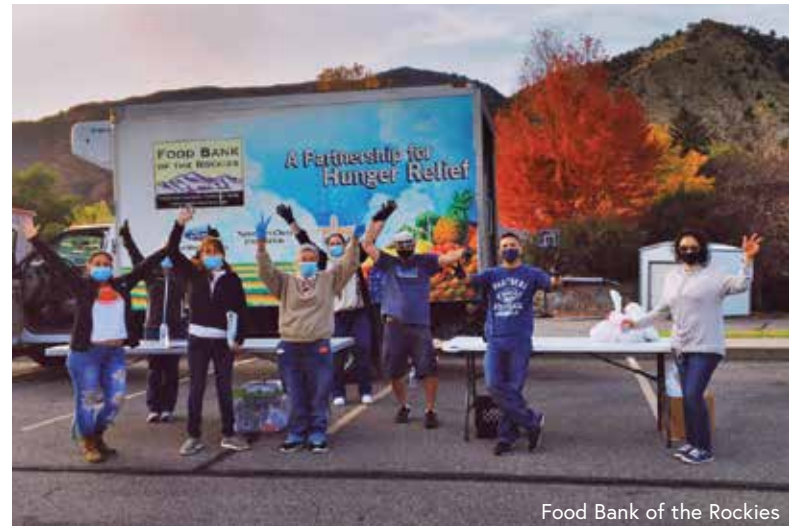
Food Bank of the Rockies