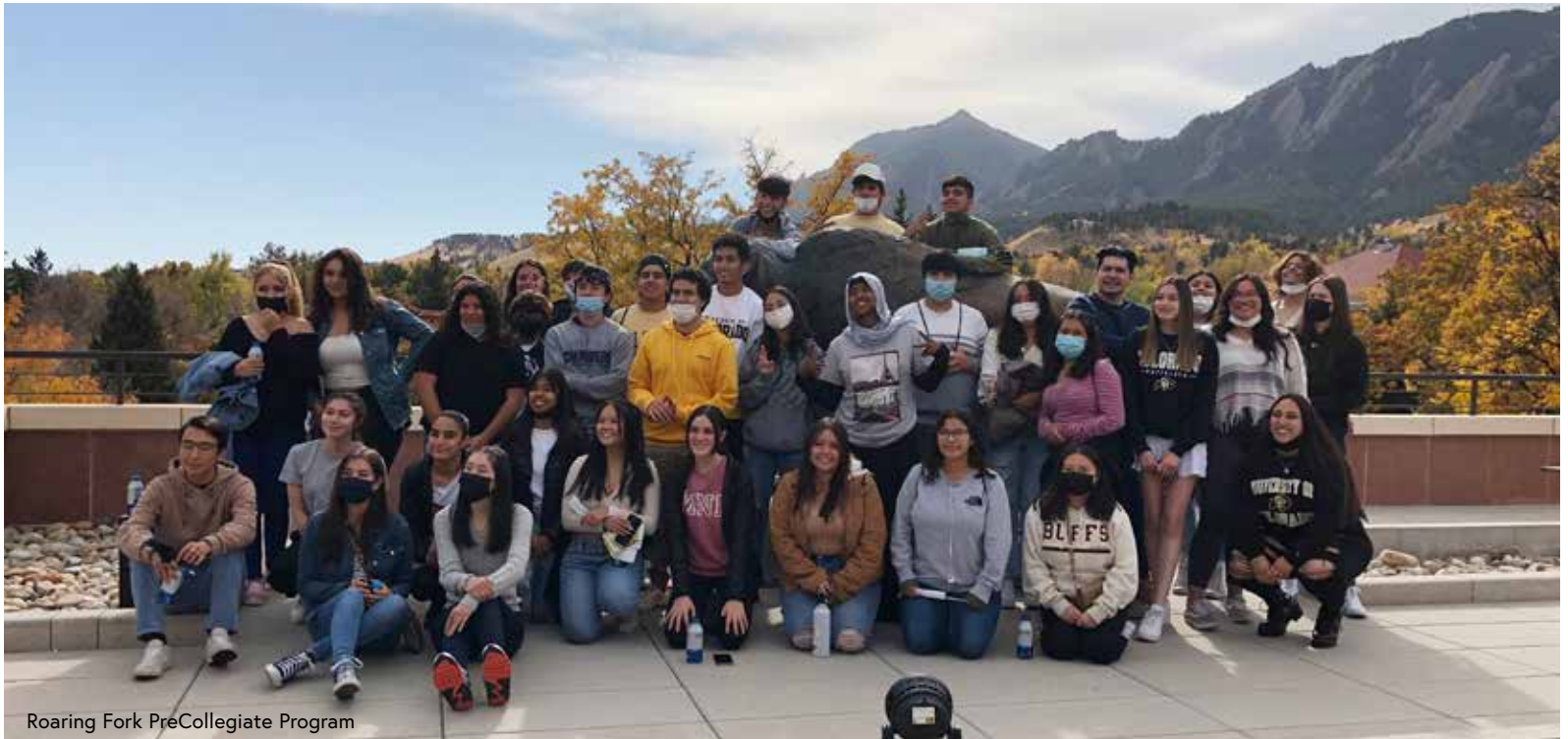
Roaring Fork PreCollegiate Program

Presidio Graduate School Processional Arts Workshop Project HOPE ProPublica Prostate Cancer Foundation Public Land Solutions Raisbeck Aviation High School PTSA Ransom Everglades School ReEvolution The Regents of University of California Register2Vote Fund Roca Room to Read Saint Joseph's Indian School