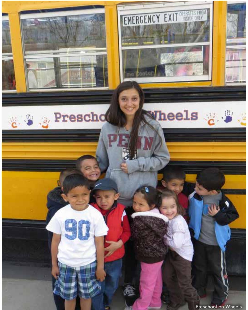
Preschool on Wheels