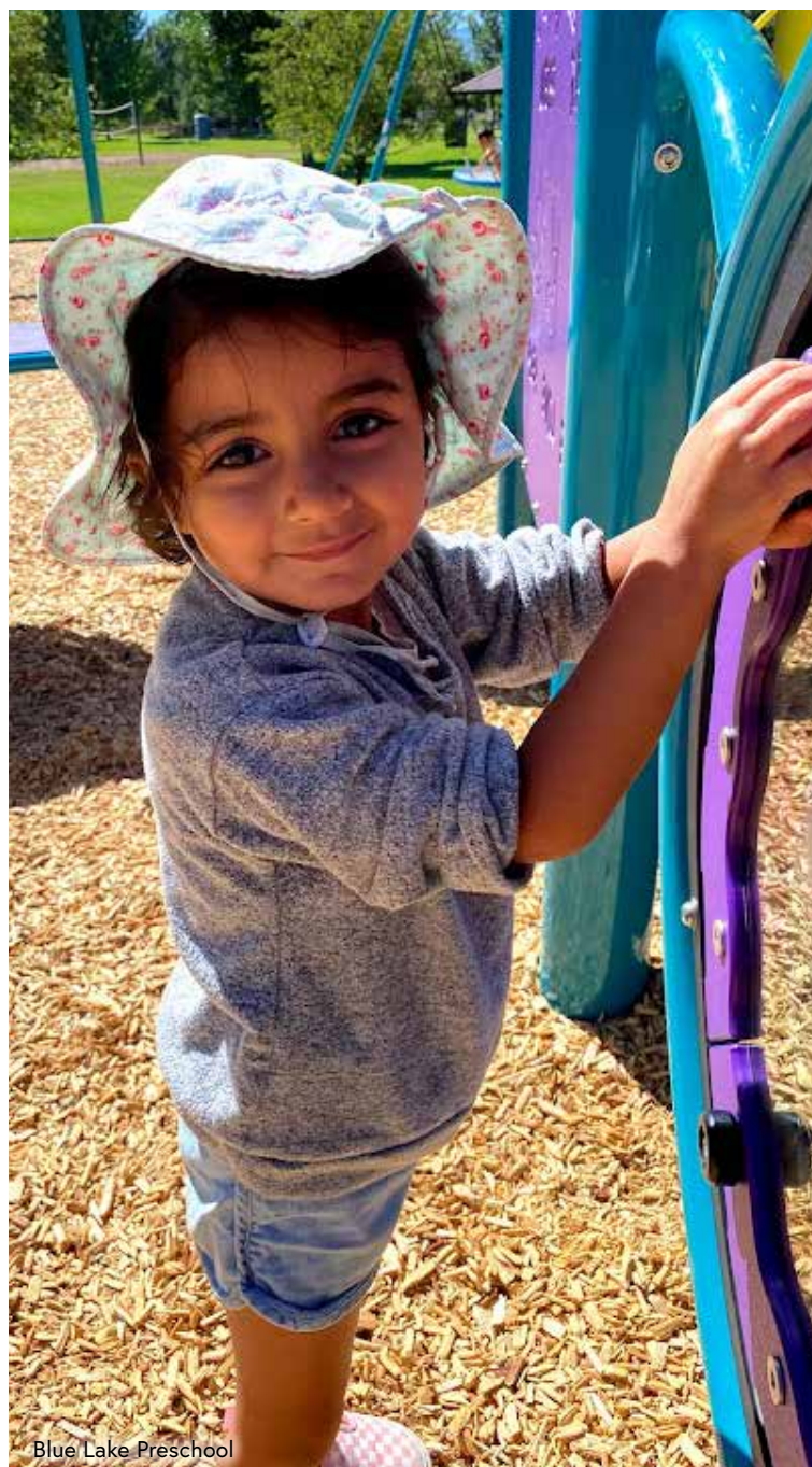
Blue Lake Preschool

Ultimate Ski Pass honors a 41-year partnership with Aspen Skiing Company through a limited number of one-year fully transferable ski passes. The funds raised from the sale of these exclusive passes benefit youth from Aspen to Parachute by supporting ACF's Cradle to Career Fund.